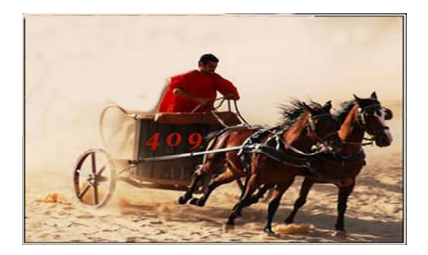
Study posted on RadicalGrace.com & RadicalGrace Bible Studies YouTube channel June 12, 2018