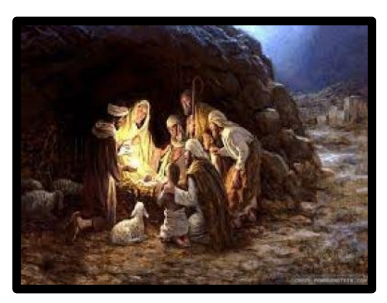
The Life of Jesus #s 4-8

I grew up in the church and have faithfully participated in every rite and ritual.