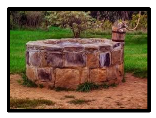
Great Stories of the O. T. # 91

As I was listening with delight to the excellent study of the" 5 Wells"