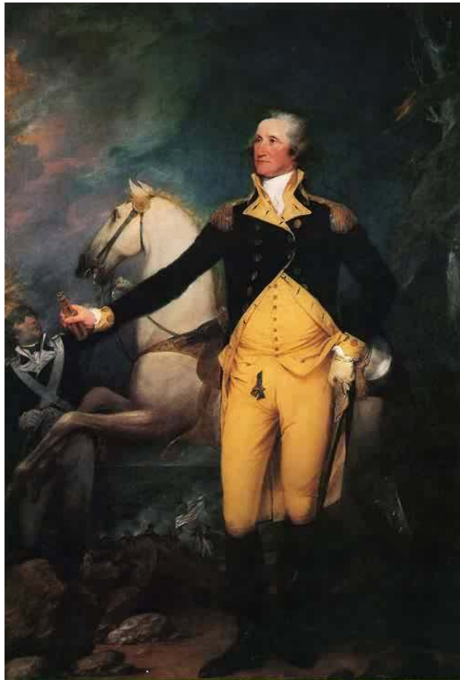
John Trumbull 1756 - 1843 General George Washington at Trenton 1792