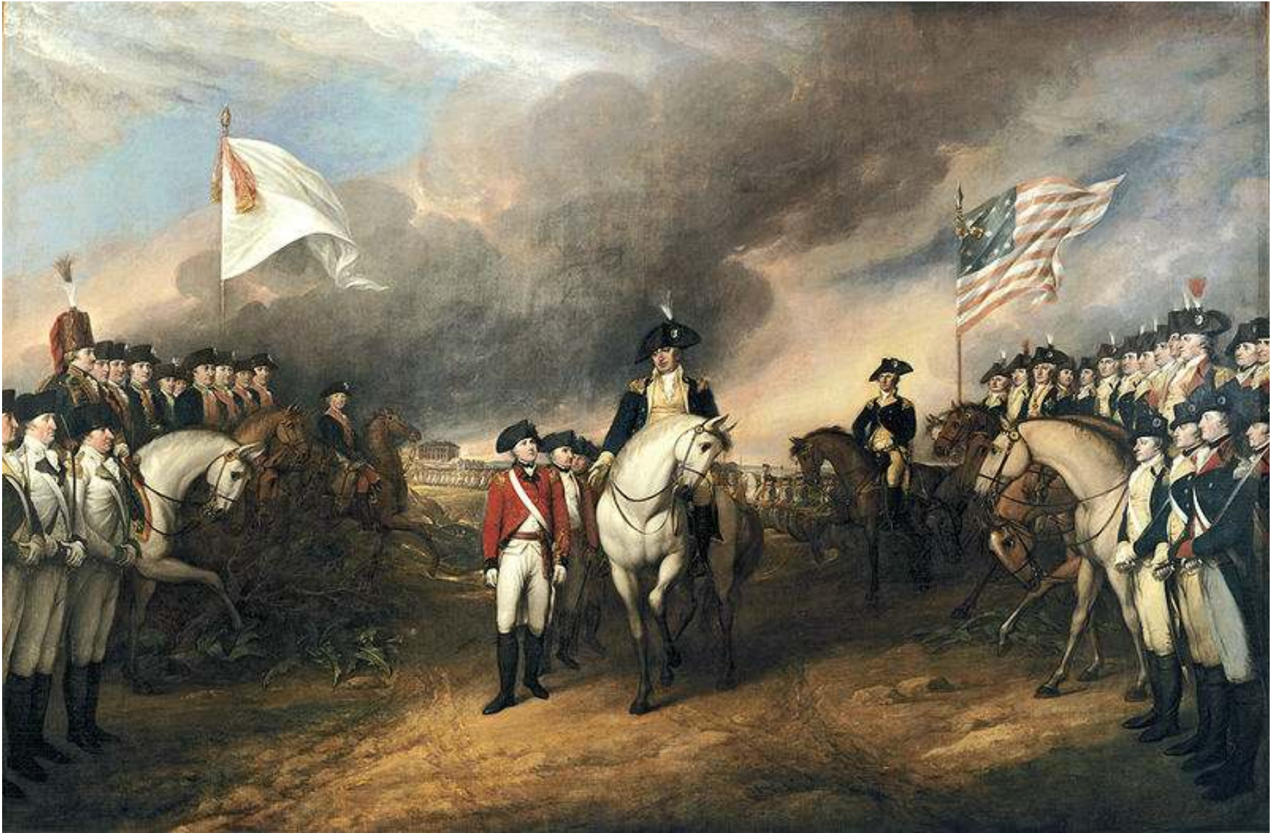
The Surrender of Lord Cornwallis 1820