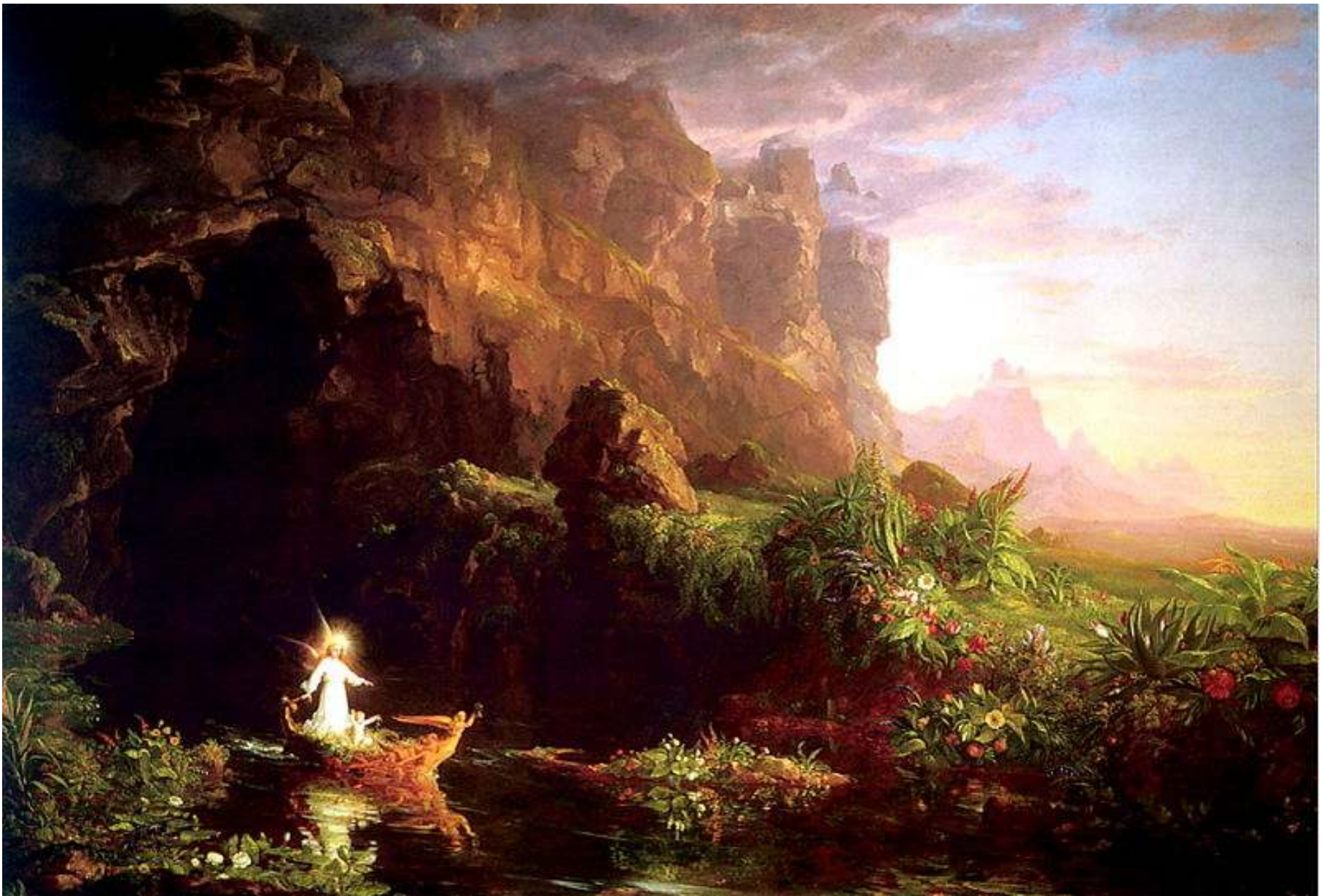
Thomas Cole, "The Voyage of Life 1842" Childhood