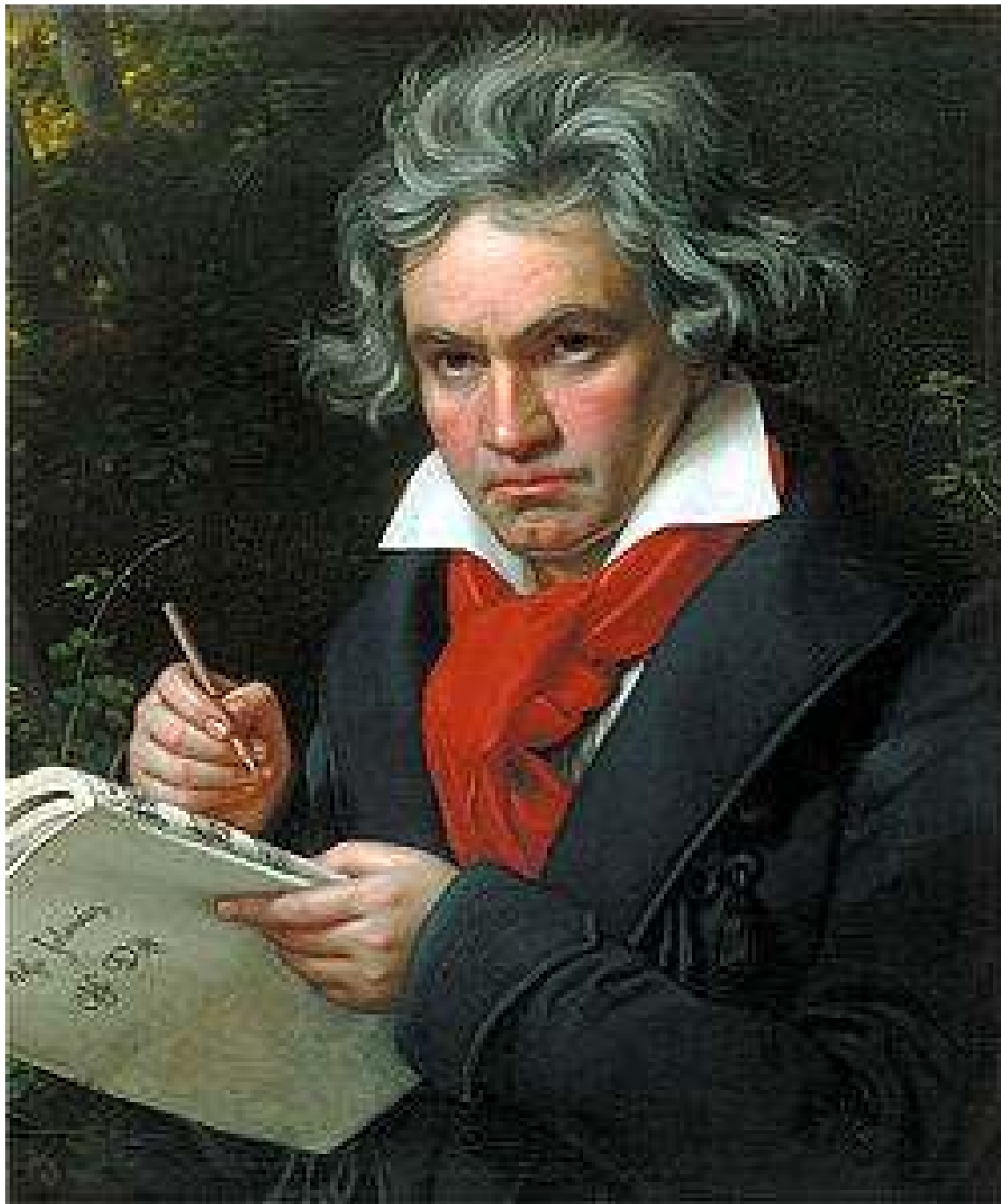
Ludwig van Beethoven 1770 – 1827