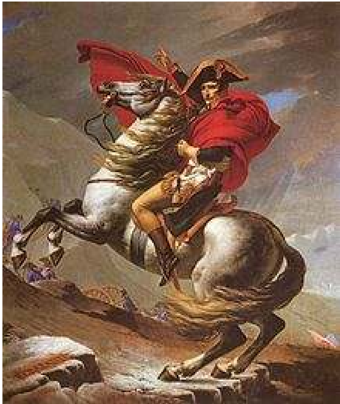
Jacques-Louis David 1748 - 1825: Napoleon at the Saint-Bernard Pass 1801