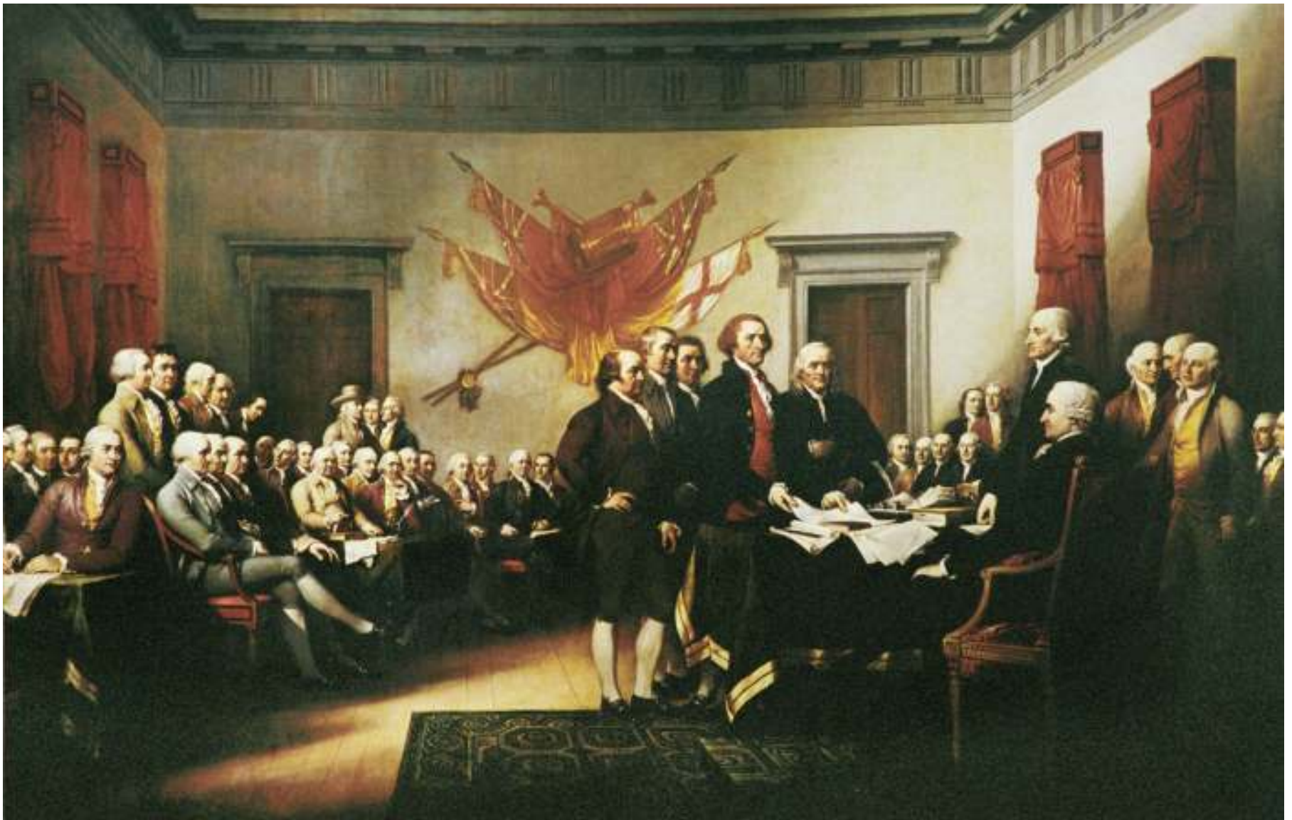
The Declaration of Independence 1776