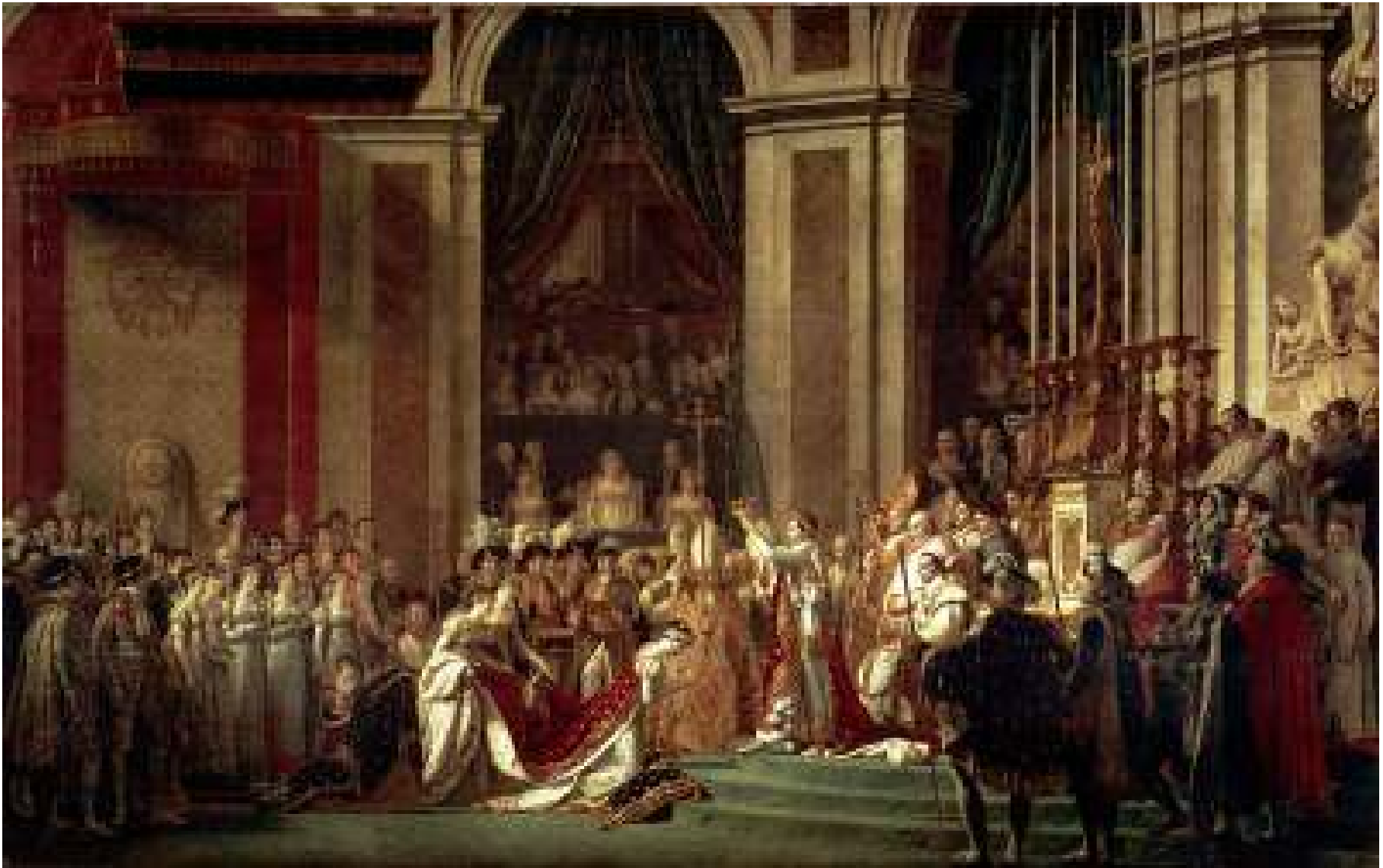
The Coronation of Napoleon 1806