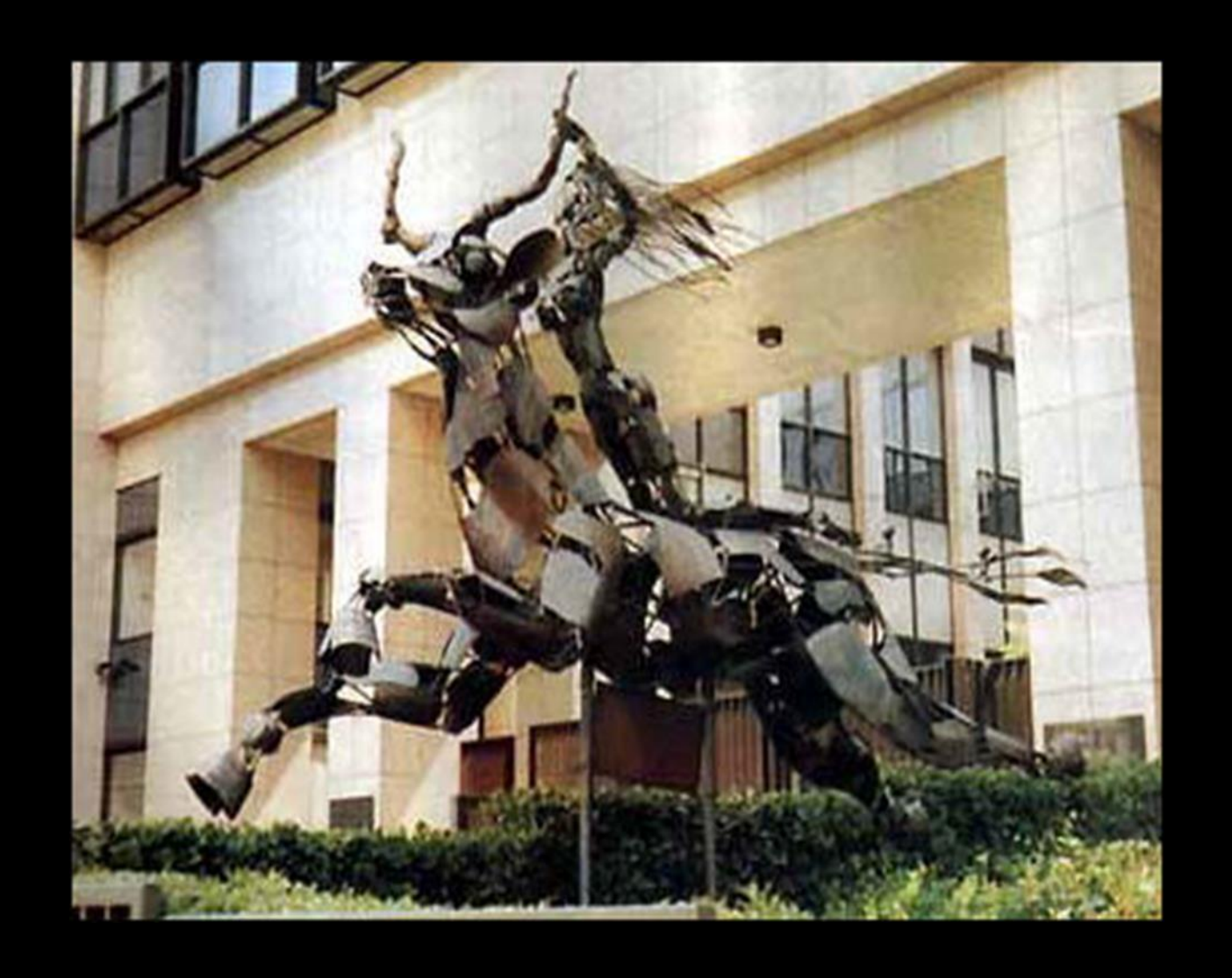
Statue in front of the EU Headquarters in Brussels, Belgium