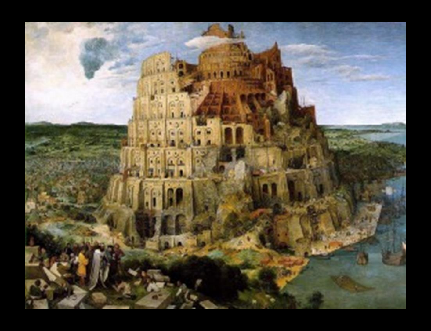
"The Tower of Babel" by Pieter Bruegel, a Flemish Renaissance painter and printmaker, 1563