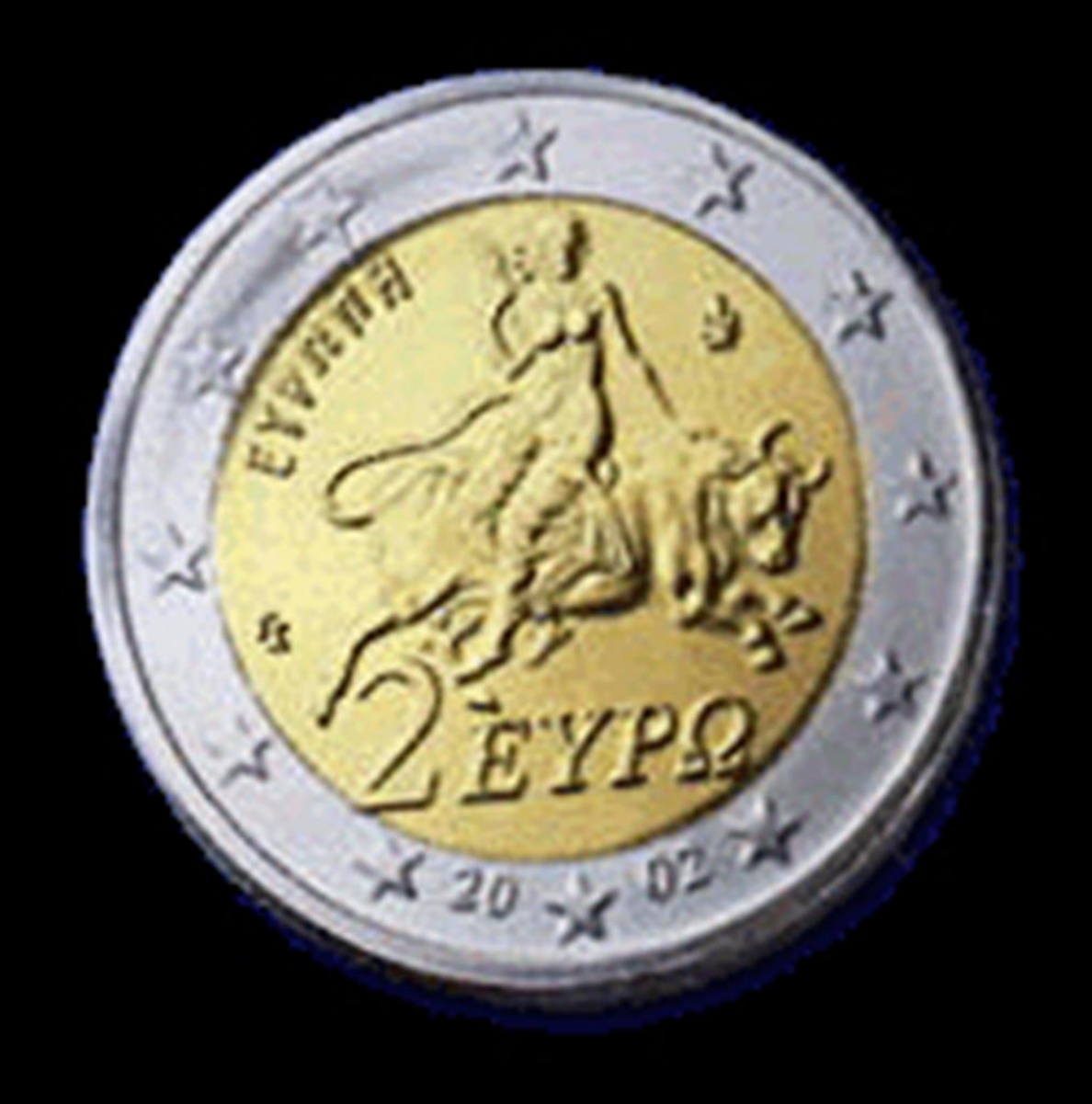
A 2 Euro coin was released in Greece that depicts a woman riding a beast