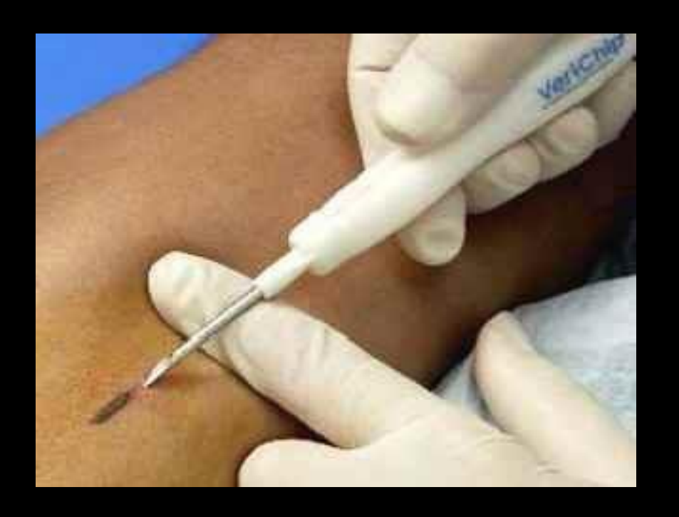
Inserting the chip